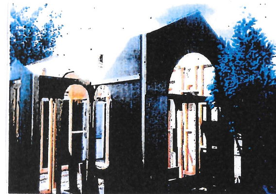
THE ORIGINAL CHAPEL BEING BUILT IN THE GARDEN OF ST FURSEYS HOUSE AUG 1998