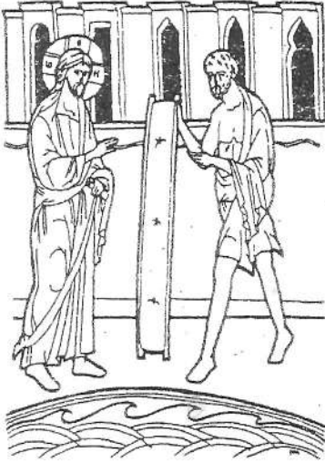
HEALING OF THE PARALYTIC

The fourth Sunday is dedicated to Christ's healing of the paralytic. (John 5) The man is healed by Christ while waiting to be put down into the pool of water. Through baptism in the church we, too, are healed and saved by Christ for eternal life. Thus, in the church, we are told, together with the paralytic, to "sin no more that nothing worse befall you." (John 5:14)