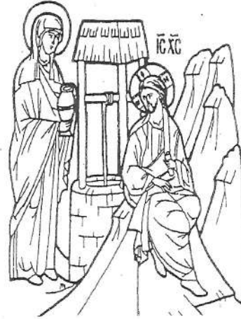
THE SAMARITAN WOMAN

The fifth Sunday after Easter deals with the woman of Samaria with whom Christ spoke at Jacob's Well. (John 4) Again the theme is the "living water" and the recognition of Jesus as God's Messiah. (John 4: 10-11; 25-26) We are reminded of our new life in him, of our own drinking of the "living water," of our own true worship of God in the Christian messianic age "in Spirit and in Truth" (John 4:23-24) We see as well that salvation is offered to all: Jews and Gentiles, men and women, saints and sinners.