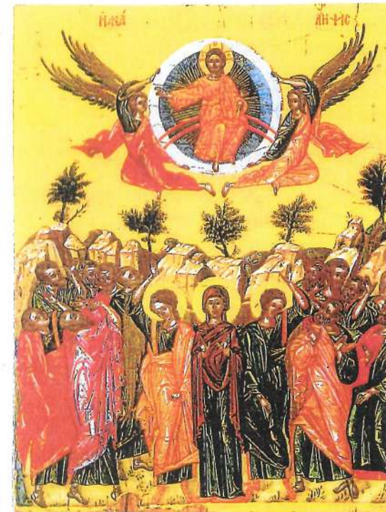
The Thursday of the Ascension of our Lord Jesus Christ Troparion

T HOU hast ascended in glory, Christ our God, thou hast made glad the disciples by the promise of the Holy Spirit: through this blessing thou hast verily assured them that thou art the Son of God, the Redeemer of the world.