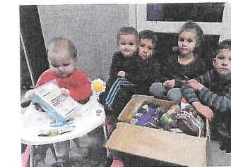
Ukrainian Christian children look through their family's food.gives box