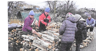
Ukrainian Christians gather up firewood provided by Barnabas