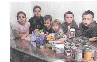
Ukrainian Christian children with much-needed supplies delivered through food.gives