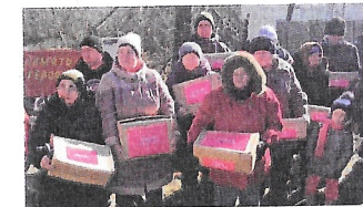
Ukrainian Christians living in the ruins of their bombed village, close to the frontline of the war, receive food.gives boxes full of much-needed supplies. Aid was distributed swiftly because of the constant danger of renewed shelling

"Thank you for everything. God bless you all."