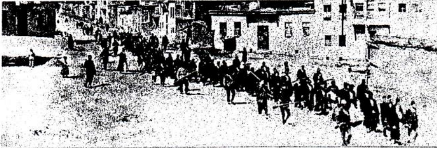
Armenians marched by Turkish soldiers

CHRIST-LIKE CONDUCT DURING THE ARMENIAN GENOCIDE